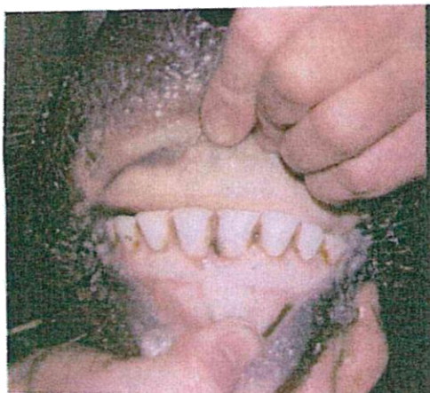
correct and on the pad

Remember to check mouth for being over or under shot (teeth not meeting the pad).